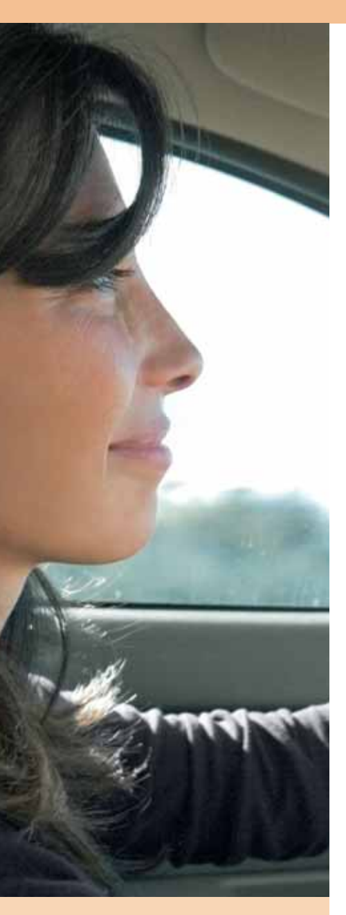
Analysts predict that in 2010 one in every 4 or 5 new passenger cars will be equipped with humidity and air quality sensors.